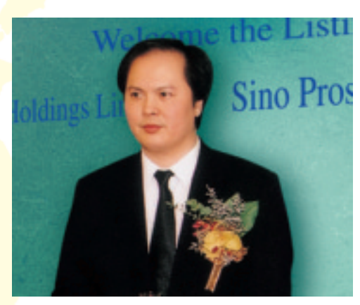
"... a firm milestone of the Company ..."

We believe that the success of the listing bears testament to the high quality standards, which we have established in all areas of our business. We have an experienced management team and a well-trained and committed workforce, which takes pride in our achievements.